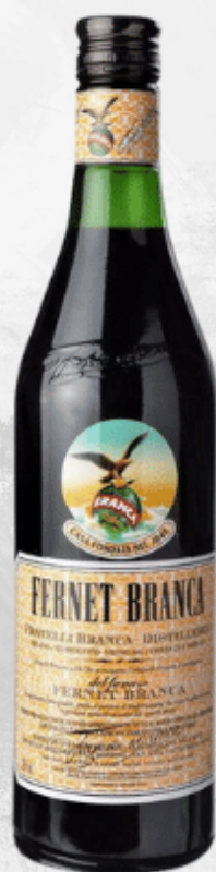
MEDIDA FERNET BRANCA