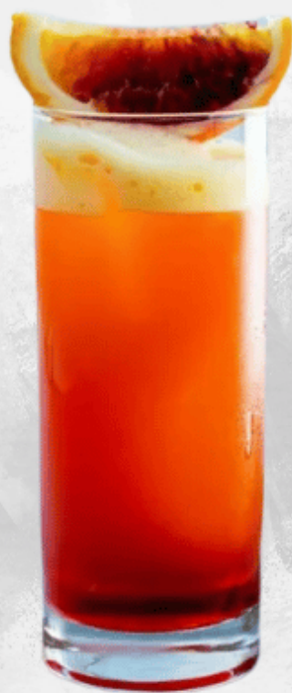
CAMPARI CON NARANJA