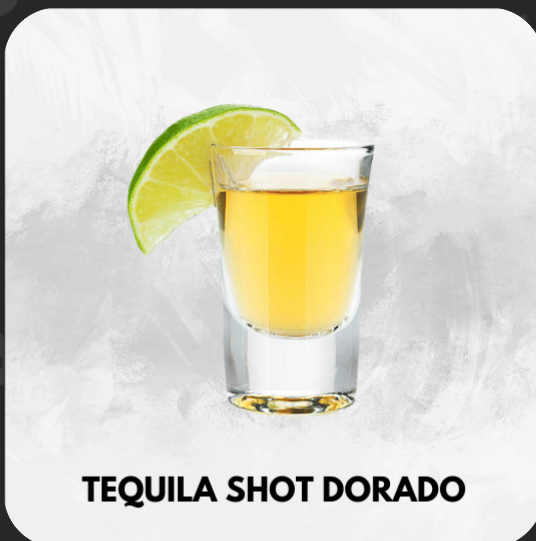
TEQUILA SHOT DORADO