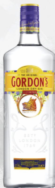
MEDIDA GIN GORDON'S